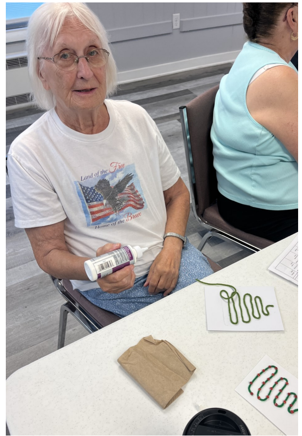
Crafting and getting creative!

These guys always call the right pocket Join them on Wednesdays (11-1) for billiards