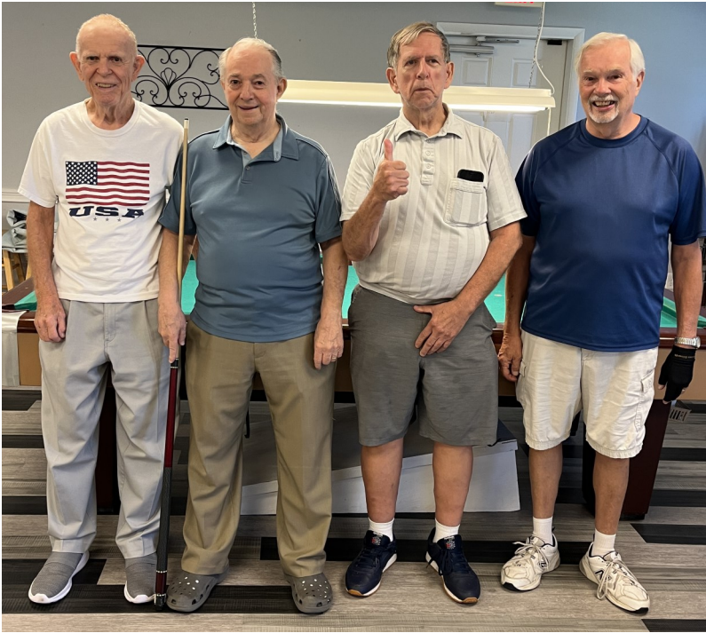
Pool sharks pictured above.

These guys always call the right pocket Join them on Wednesdays (11-1) for billiards