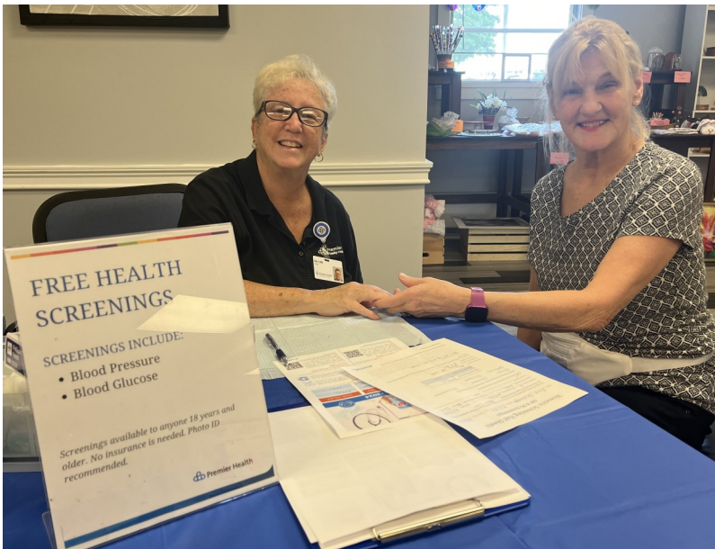
Free health screenings with Premier are always a good idea :)